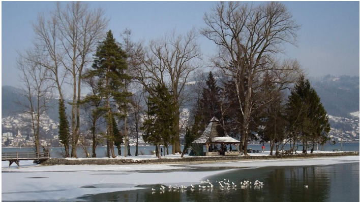
Interlaken Tourismus - web@interlaketourism.ch