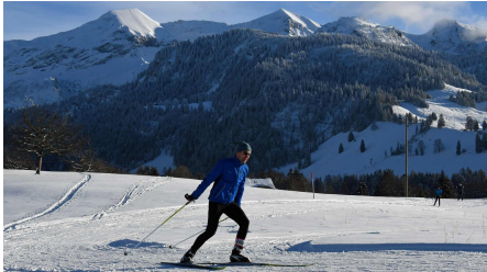
Aeschi Tourismus, Interlaken Tourismus - web@interlaketourism.ch