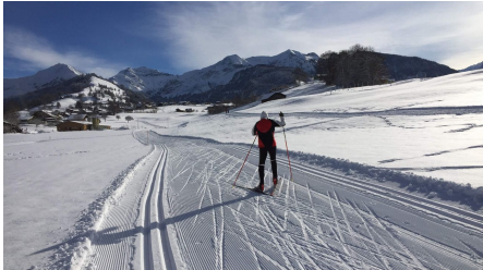
Aeschi Tourismus, Interlaken Tourismus - web@interlaketourism.ch