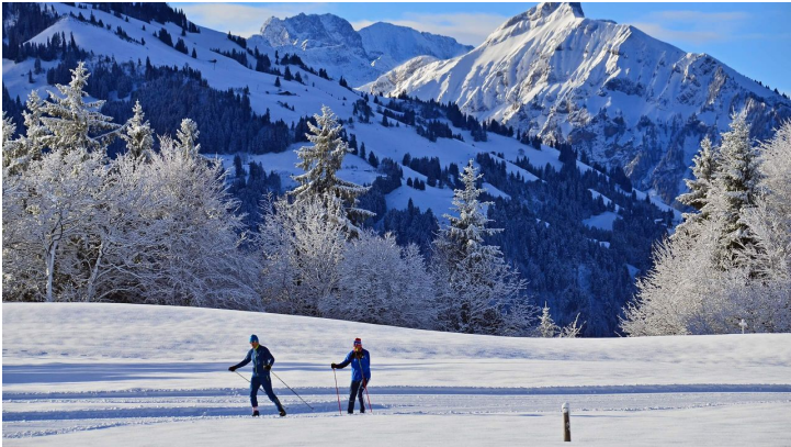
Aeschi Tourismus, Interlaken Tourismus - web@interlaketourism.ch