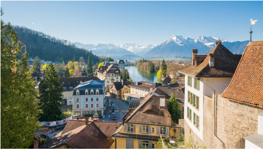
Interlaken Tourismus - web@interlaketourism.ch