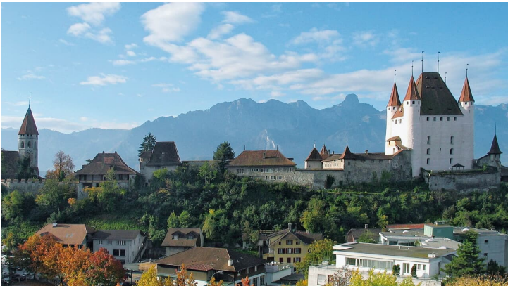
Interlaken Tourismus - web@interlaketourism.ch