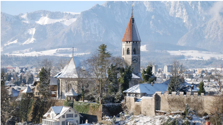
Interlaken Tourismus - web@interlaketourism.ch