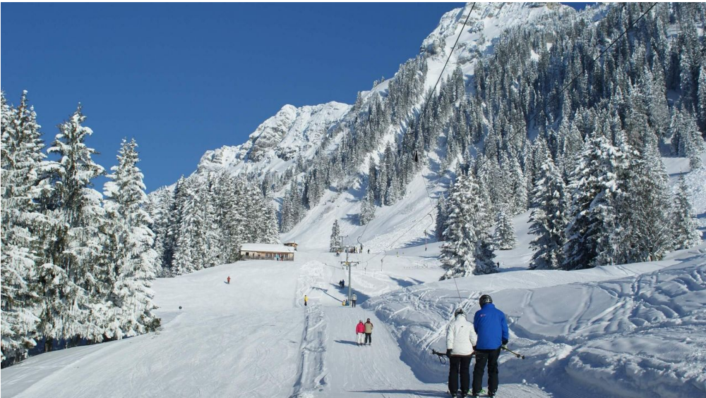
Skigebiet Sigriswil-Schwanden