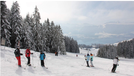
Skigebiet Sigriswil-Schwanden