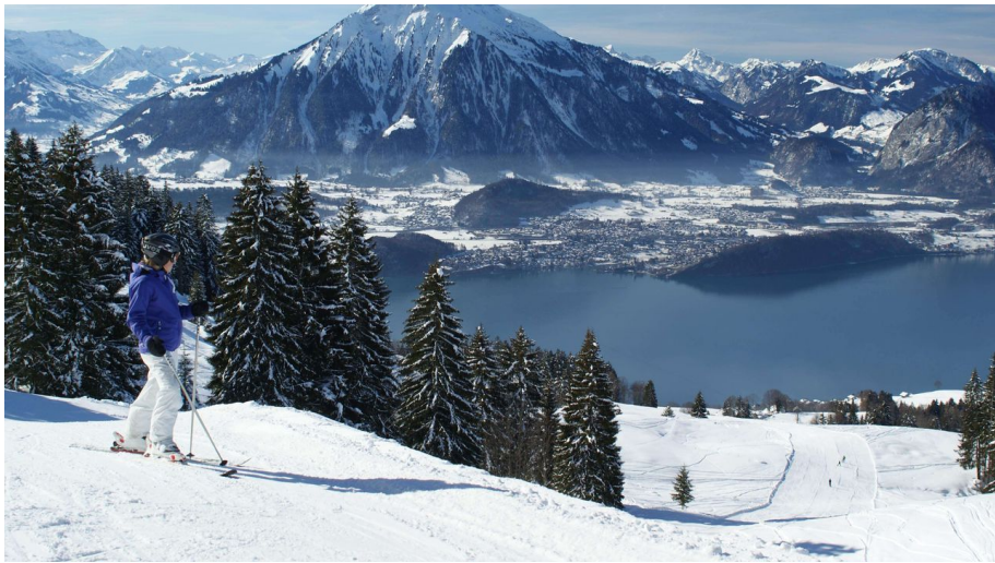
Skigebiet Sigriswil-Schwanden

ski/snowboard cross-country skiing winter