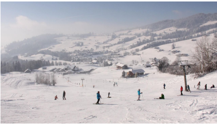
Skigebiet Sigriswil-Schwanden