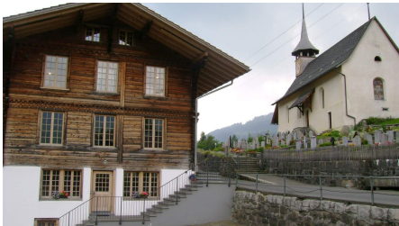
Verein Ortsgeschichte Habkern, Interlaken Tourismus