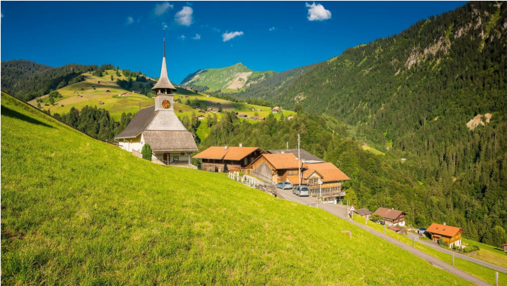
Tourismus-Organisation Interlaken, Interlaken Tourismus - web@interlaketourism.ch