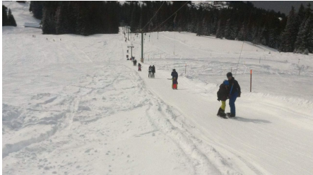
Skilift Hohwald Beatenberg AG