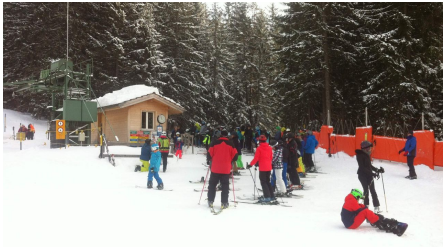
Skilift Hohwald Beatenberg AG, Interlaken Tourismus - web@interlaketourismus.ch