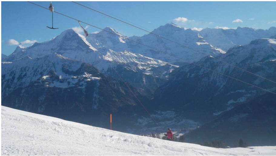
Skilift Hohwald Beatenberg AG, Interlaken Tourismus - web@interlaktourismus.ch