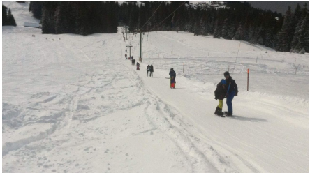
Skilift Hohwald Beatenberg AG, Interlaken Tourismus - web@interlaketourismus.ch