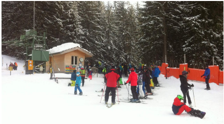
Skilift Hohwald Beatenberg AG