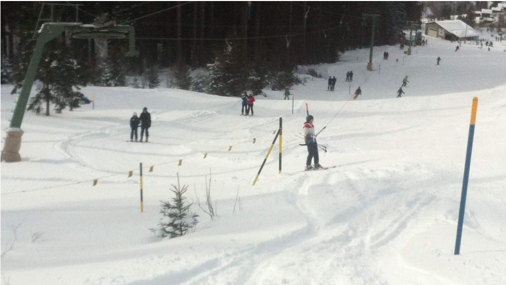
Skilift Hohwald Beatenberg AG, Interlaken Tourismus - web@interlaketourismus.ch

_____ The ski lift only opens in good snow conditions. If you are not sure whether the conditions are good enough, please check the provider's website or ask by phone.