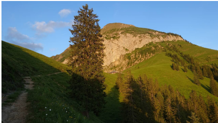
Aeschi Tourismus, Interlaken Tourismus - web@interlaketourism.ch