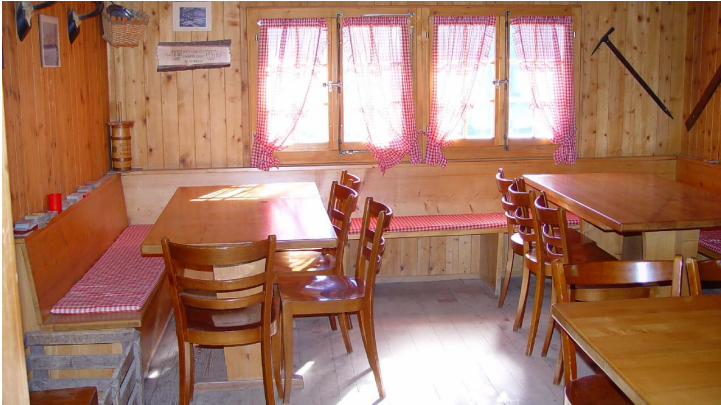
Aeschi Tourismus, Interlaken Tourismus - web@interlaketourism.ch