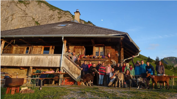
Aeschi Tourismus, Interlaken Tourismus - web@interlaketourism.ch