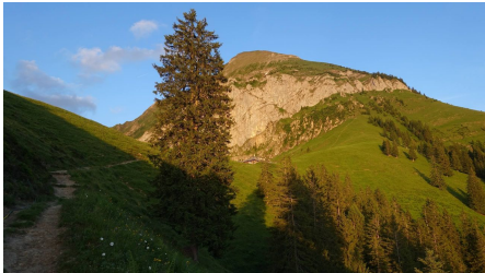
Aeschi Tourismus, Interlaken Tourismus - web@interlaketourism.ch