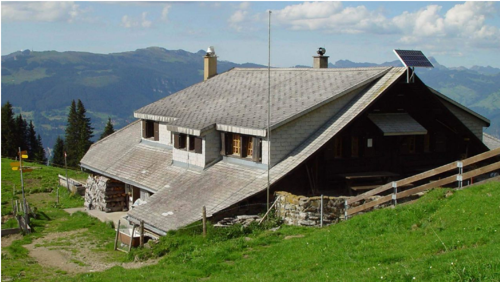
Aeschi Tourismus, Interlaken Tourismus - web@interlaketourism.ch