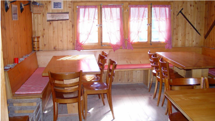
Aeschi Tourismus, Interlaken Tourismus - web@interlaketourism.ch