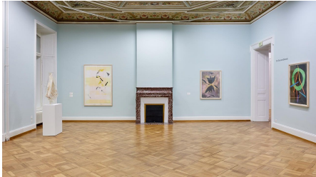
Kunstmuseum Thun, Interlaken Tourismus - web@interlaketourism.ch