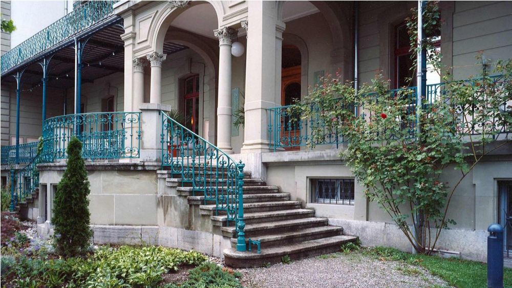
Kunstmuseum Thun, Interlaken Tourismus - web@interlaketourism.ch