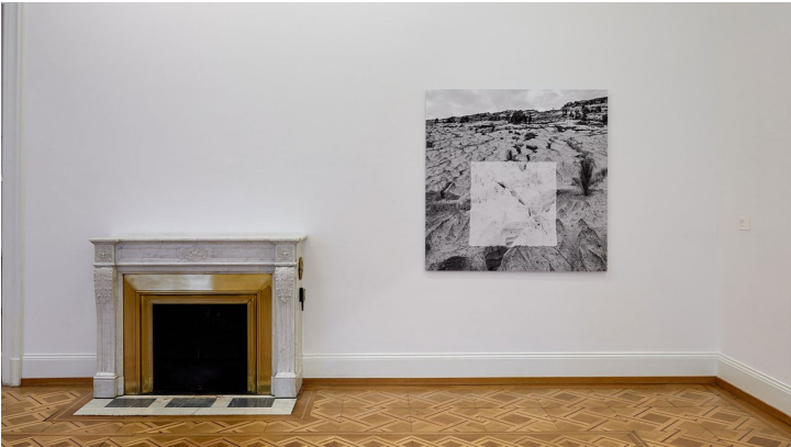
Kunstmuseum Thun, Interlaken Tourismus - web@interlaketourism.ch