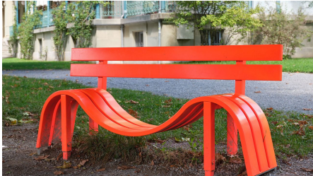
Kunstmuseum Thun