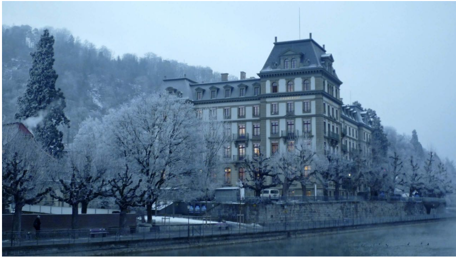
Kunstmuseum Thun, Interlaken Tourismus - web@interlaketourism.ch

museums historic buildings Disability Access summer winter