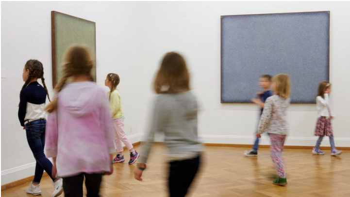
Kunstmuseum Thun, Interlaken Tourismus - web@interlaketourism.ch