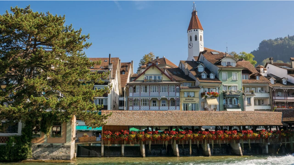
Hotel Interlaken AG, Interlaken Tourismus - web@interlaketourism.ch