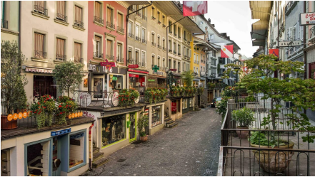
Interlaken Tourismus - web@interlaketourism.ch