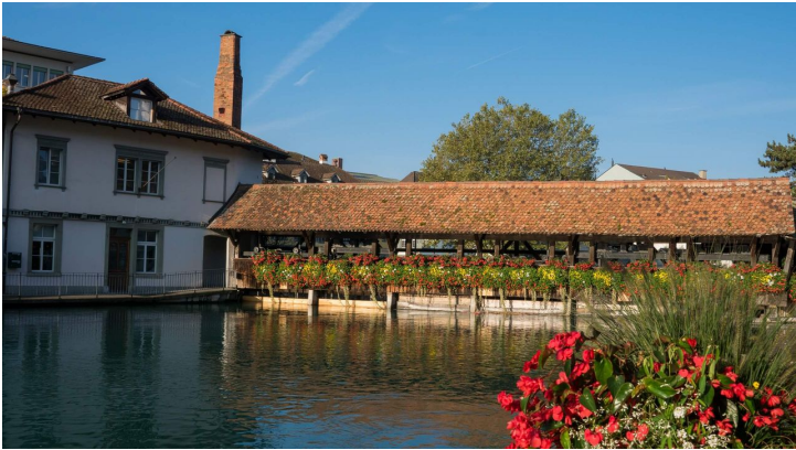
Interlaken Tourismus - web@interlaketourism.ch