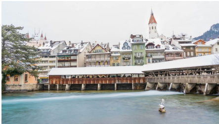
Interlaken Tourismus - web@interlaketourism.ch