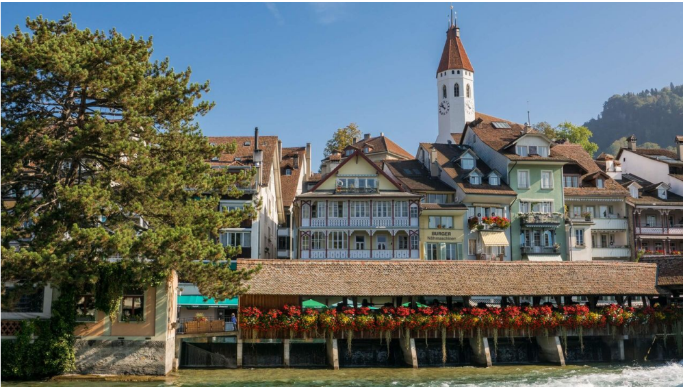
Hotel Interlaken AG, Interlaken Tourismus - web@interlaketourism.ch