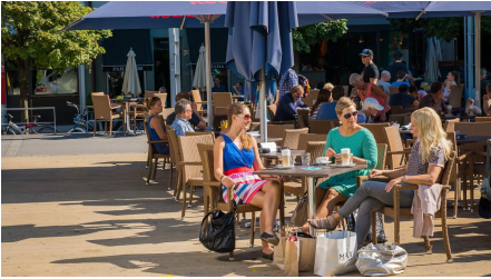
Thun-Thunersee Tourismus, Interlaken Tourismus - web@interlaketourism.ch