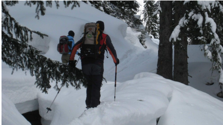
Erb Sport, Diemtigtal, Interlaken Tourismus - web@interlaketourism.ch