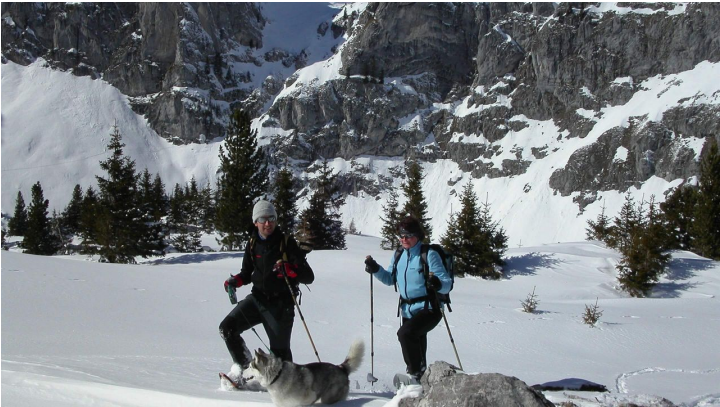
Erb Sport, Diemtigtal, Interlaken Tourismus - web@interlaketourism.ch