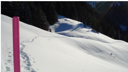
Erb Sport, Diemtigtal