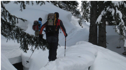
Erb Sport, Diemtigtal, Interlaken Tourismus - web@interlaketourism.ch