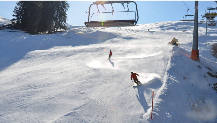
Naturpark Diemtigtal, Interlaken Tourismus - web@interlaketourism.ch