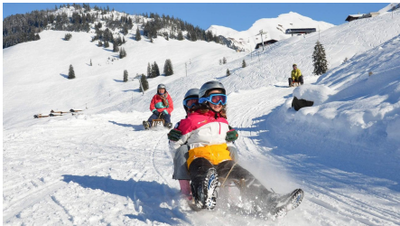
Naturpark Diemtigtal, Interlaken Tourismus - web@interlaketourism.ch