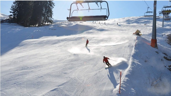
Naturpark Diemtigtal, Interlaken Tourismus - web@interlaketourism.ch