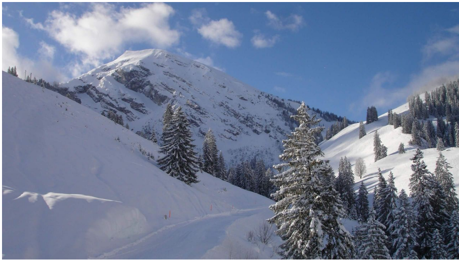
Naturpark Diemtigtal, Interlaken Tourismus - web@interlaketourism.ch