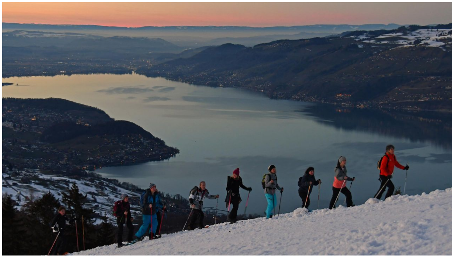
Aeschi Tourismus, Interlaken Tourismus - web@interlaketourismus.ch