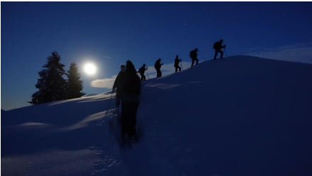
Aeschi Tourismus, Interlaken Tourismus - web@interlaketourism.ch