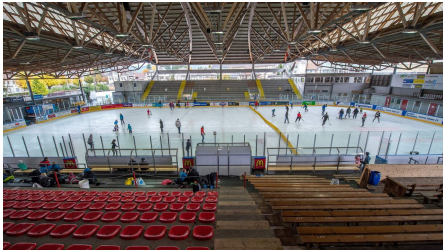
Kunsteisbahn Thun