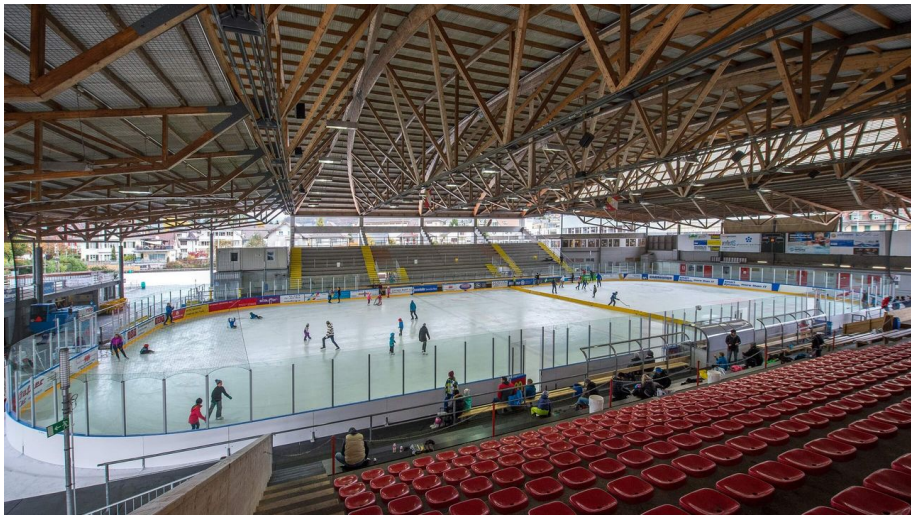
Kunsteisbahn Thun