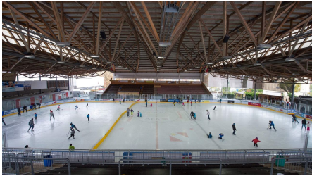
Kunsteisbahn Thun