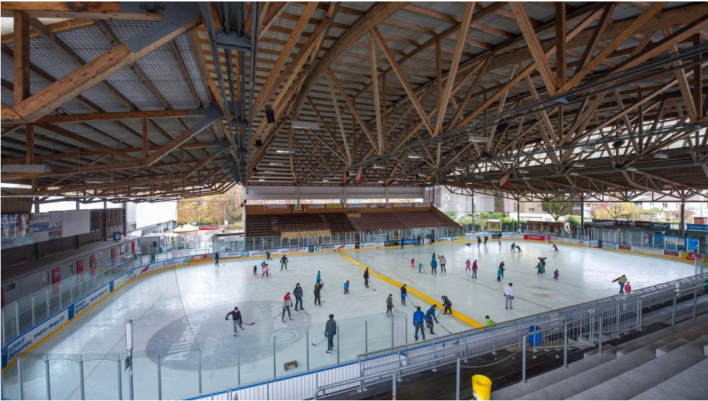
Kunsteisbahn Thun, Interlaken Tourismus - web@interlaketourismus.ch