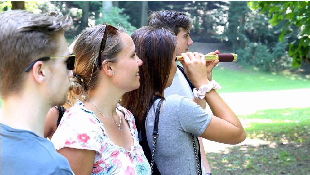
MysteryRooms Interlaken