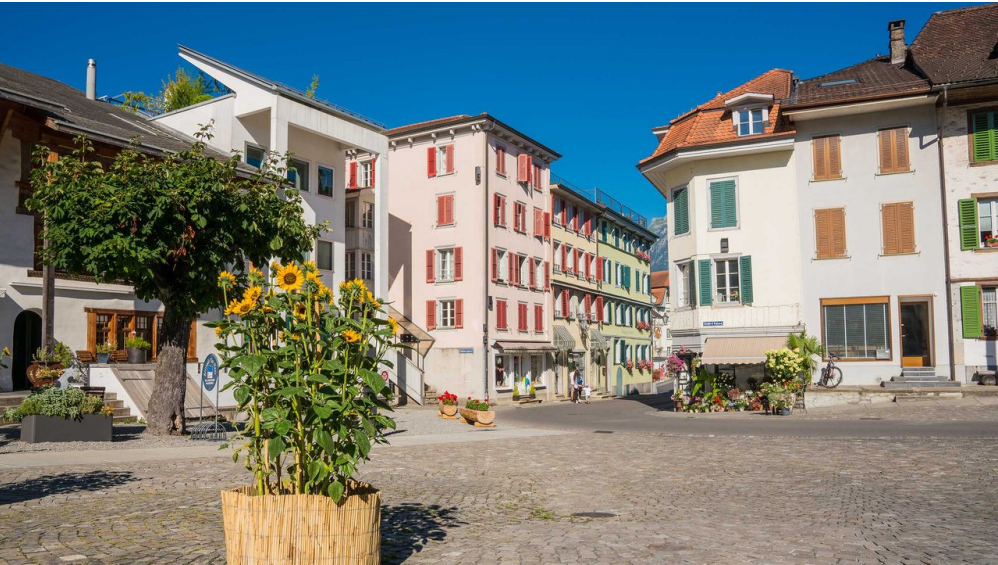
Tourismus-Organisation Interlaken, Interlaken Tourismus - web@interlaketourism.ch