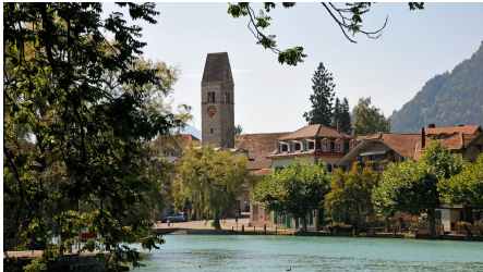
Tourismus-Organisation Interlaken, Interlaken Tourismus - web@interlaketourism.ch