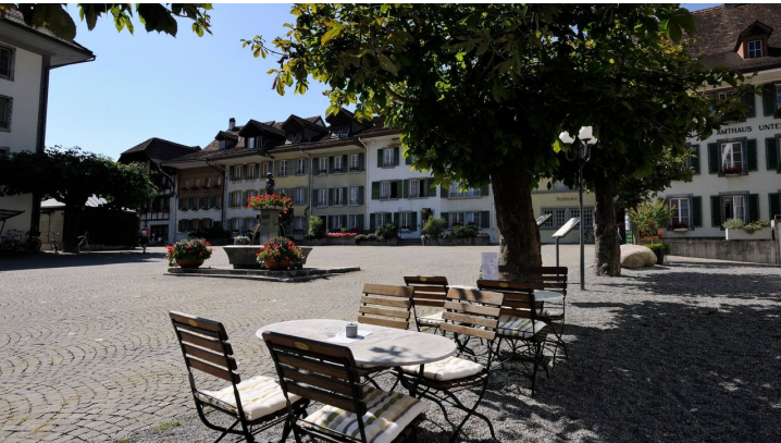
Tourismus-Organisation Interlaken, Interlaken Tourismus - web@interlaketourism.ch