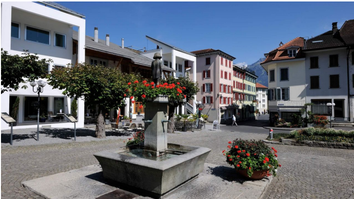
Tourismus-Organisation Interlaken, Interlaken Tourismus - web@interlaketourism.ch