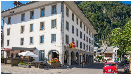
Tourismus-Organisation Interlaken, Interlaken Tourismus - web@interlaketourism.ch