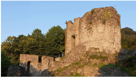
Tourismus-Organisation Interlaken, Interlaken Tourismus - web@interlaketourism.ch