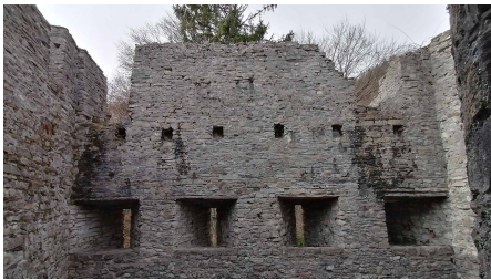
Tourismus-Organisation Interlaken, Interlaken Tourismus - web@interlaketourism.ch