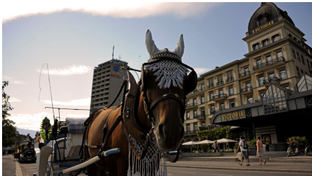
Reitschule Voegeli, Interlaken Tourismus - web@interlaketourism.ch