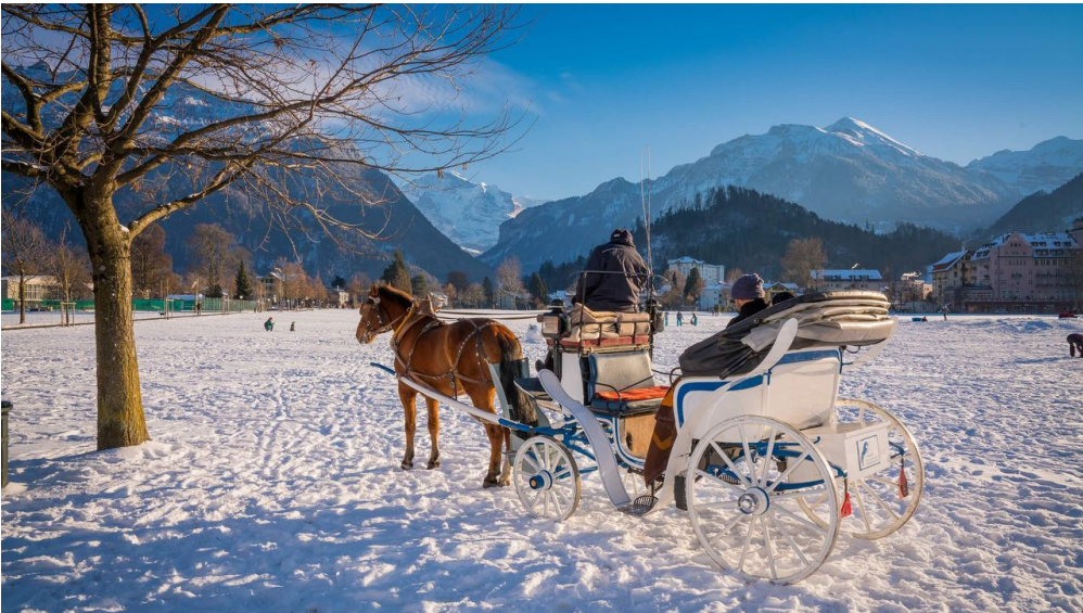
Reitschule Voegeli, Interlaken Tourismus - web@interlaketourism.ch