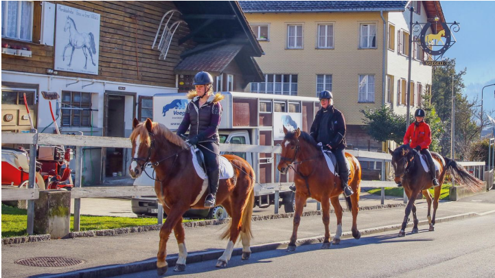
Reitschule Voegeli