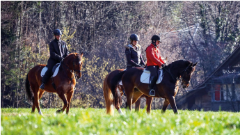
Reitschule Voegeli