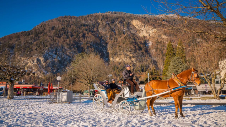
Reitschule Voegeli