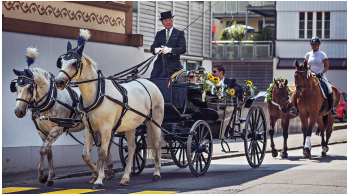
Reitschule Voegeli