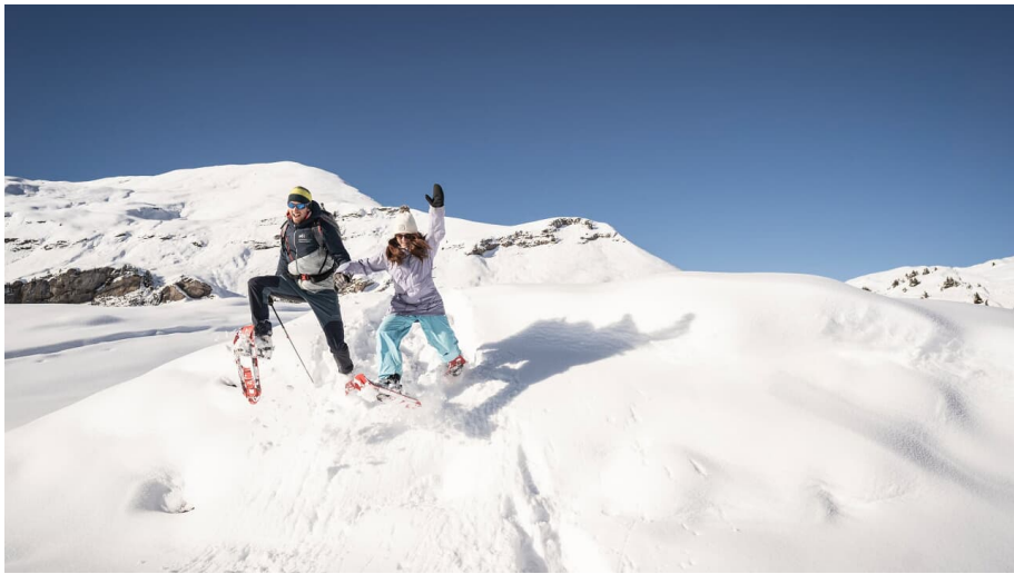
Outdoor Switzerland AG, Interlaken Tourismus - web@interlaketourism.ch

snowshoeing guides alpine landscapes winter