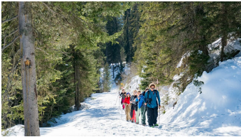
Outdoor Switzerland AG, Interlaken Tourismus - web@interlaktourism.ch