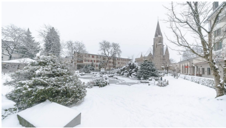
Interlaken Tourismus - web@interlaketourism.ch