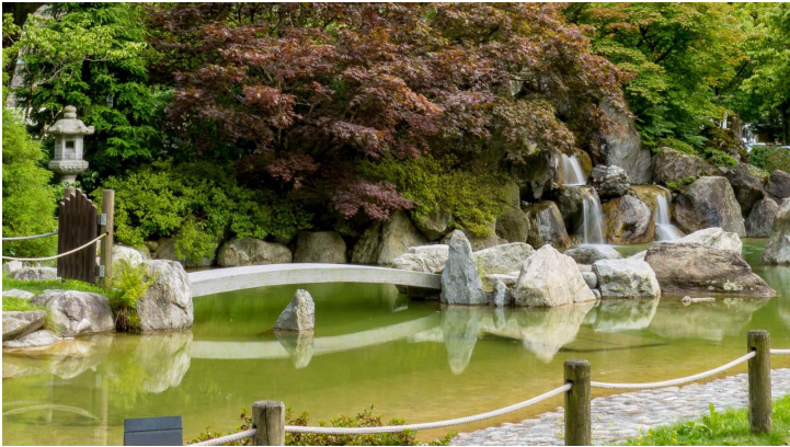
Interlaken Tourismus - web@interlaketourism.ch