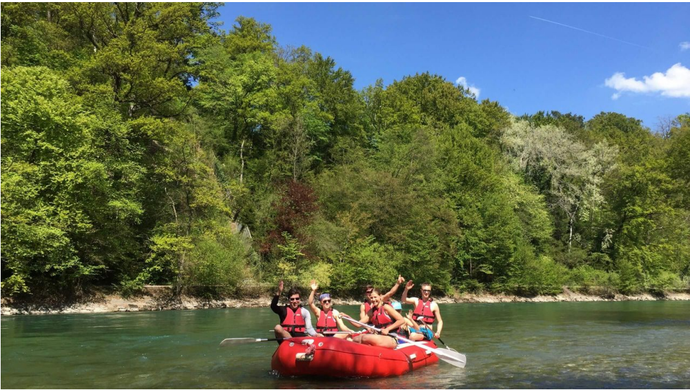
Aareschlauchboot GmbH, Interlaken Tourismus - web@interlaketourismus.ch

for Groups, for Children of the age of 10 upwards