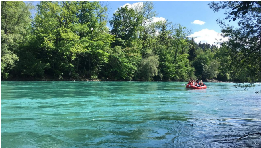
Aareschlauchboot GmbH, Interlaken Tourismus - web@interlaketourismus.ch