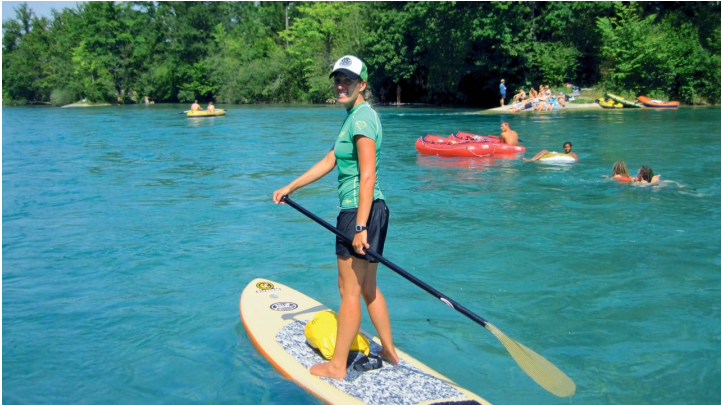
Aareschlauchboot GmbH, Interlaken Tourismus - web@interlaketourismus.ch