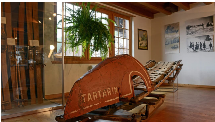
Tourismuseum, Interlaken Tourismus - web@interlaktourismus.ch