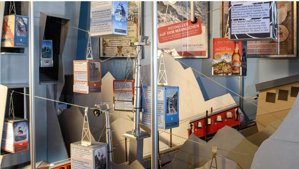
Tourismuseum, Interlaken Tourismus - web@interlaktourismus.ch

Winter & Spring: January - end of April Sunday 14.00 - 17.00 Summer season: May - October Wednesday - Sunday 2.00 - 5.00 pm Winter break November, December & public holidays