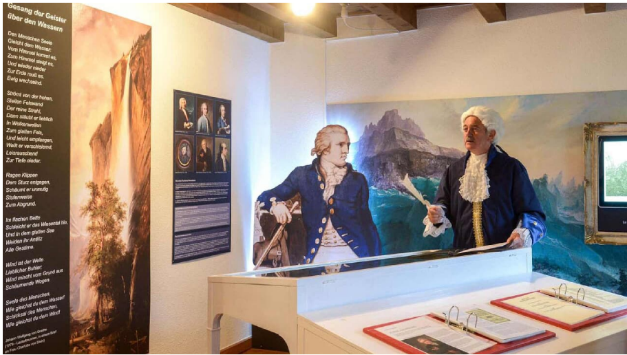
Tourismuseum, Interlaken Tourismus - web@interlaketourism.ch