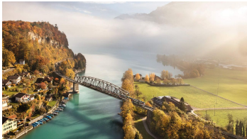
Zentralbahn AG, Interlaken Tourismus - web@interlaktourism.ch