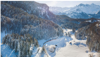
Zentralbahn AG, Interlaken Tourismus - web@interlaktourism.ch