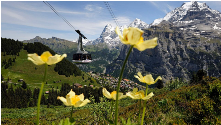
Schilthornbahn