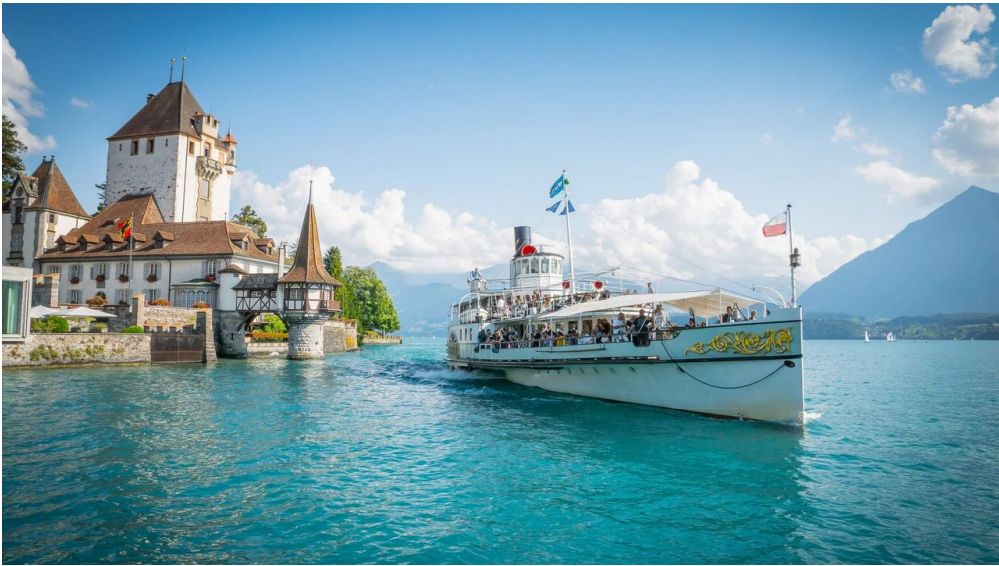
Tourismus-Organisation Interlaken, Interlaken Tourismus - web@interlaktourism.ch