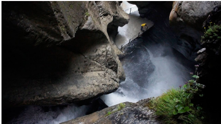
Trümmelbach Gletscherwasserfälle