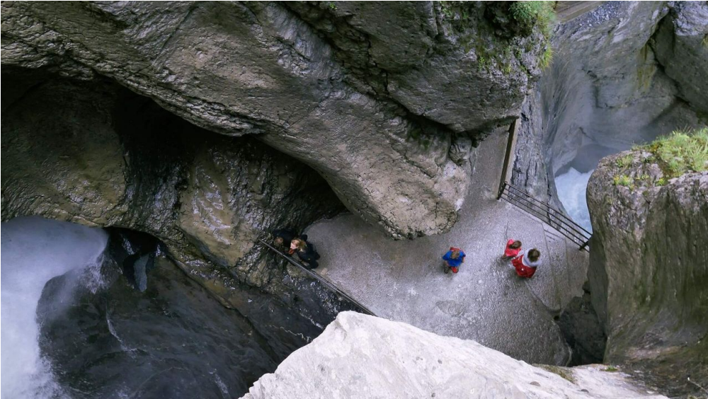
Trümmelbach Gletscherwasserfälle, Interlaken Tourismus - web@interlaktourism.ch