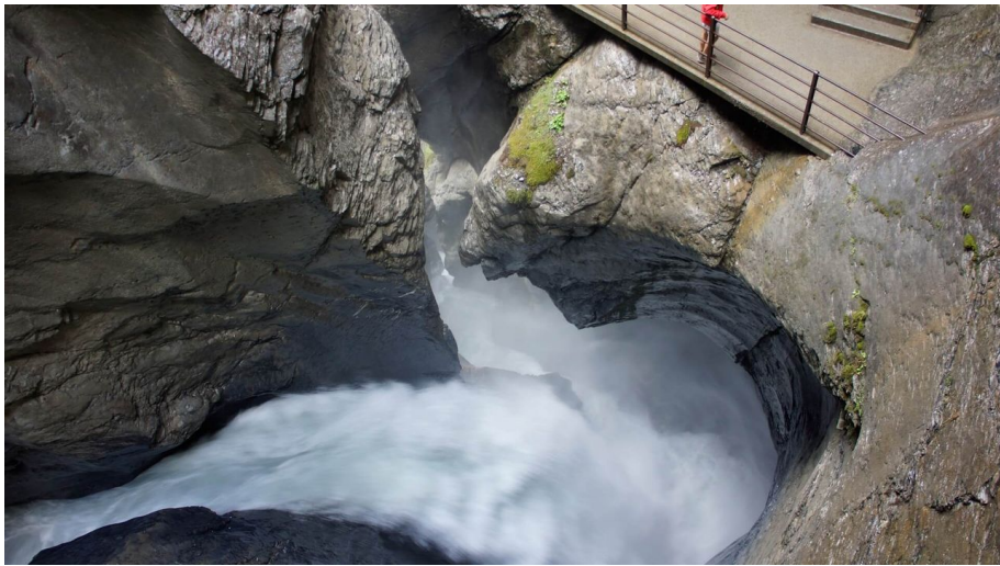
Trümmelbach Gletscherwasserfälle