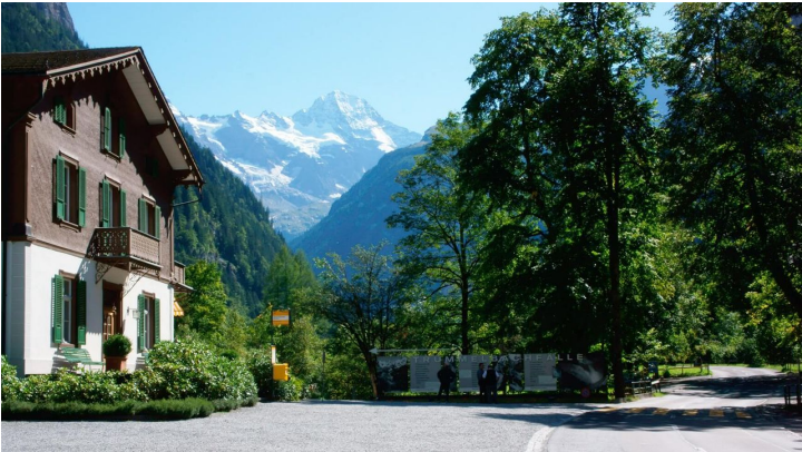
Trümmelbach Gletscherwasserfälle