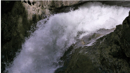
Trümmelbach Gletscherwasserfälle