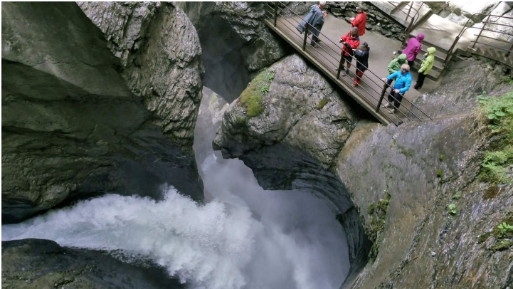
Trümmelbach Gletscherwasserfälle