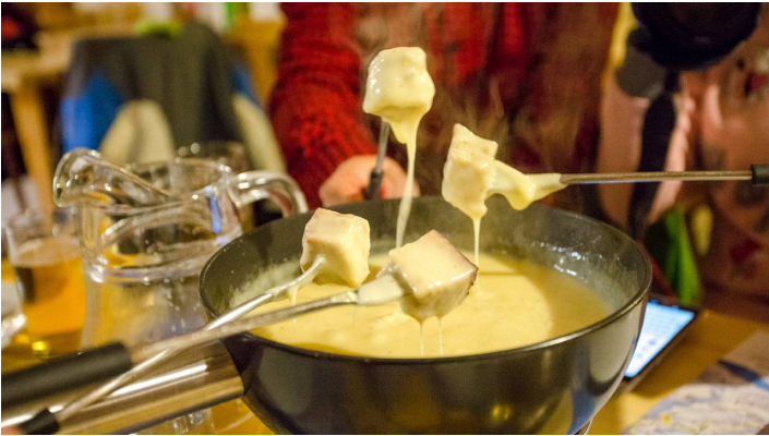
Outdoor Switzerland AG, Interlaken Tourismus - web@interlaketourism.ch

December – March (depending on snow conditions)