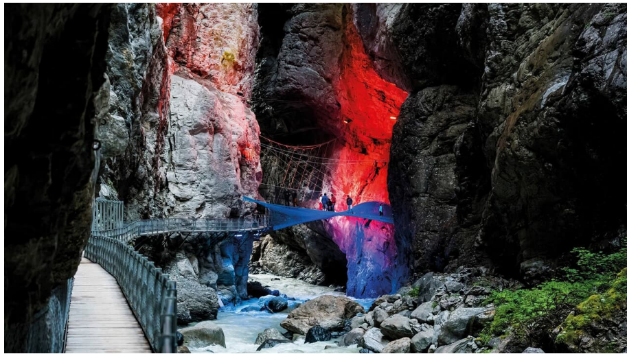
Outdoor Switzerland AG, Interlaken Tourismus - web@interlaketourism.ch