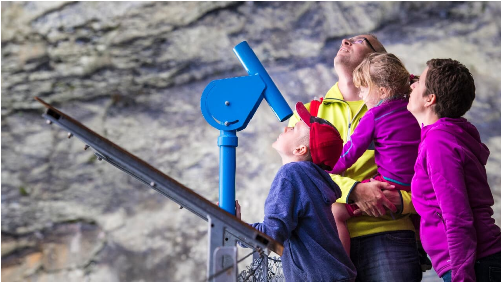
Outdoor Switzerland AG, Interlaken Tourismus - web@interlaketourism.ch