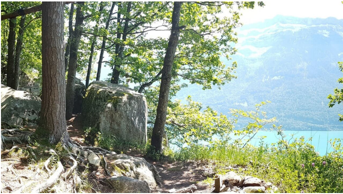
Interlaken Tourismus - web@interlaketourism.ch