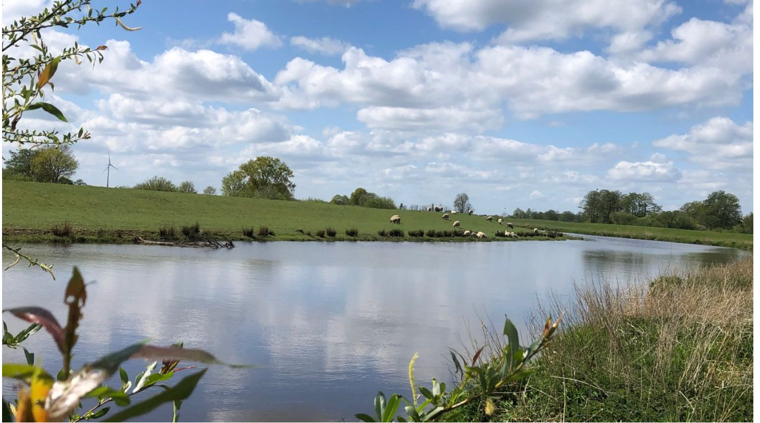
Flusslandschaft Aper Tief