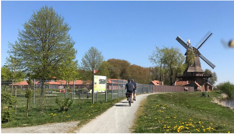
Radfahrer-Hengstföhrer Mühle-Apen