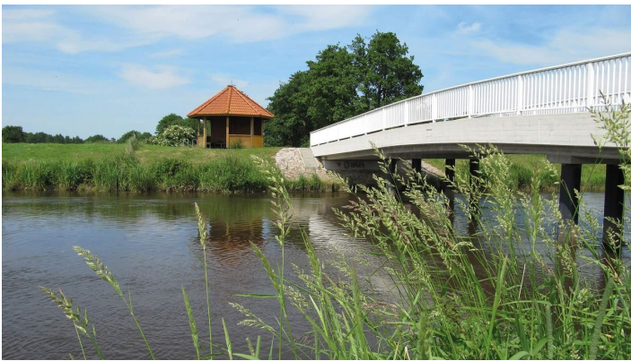
Bokeler Brücke mit Aper Tief