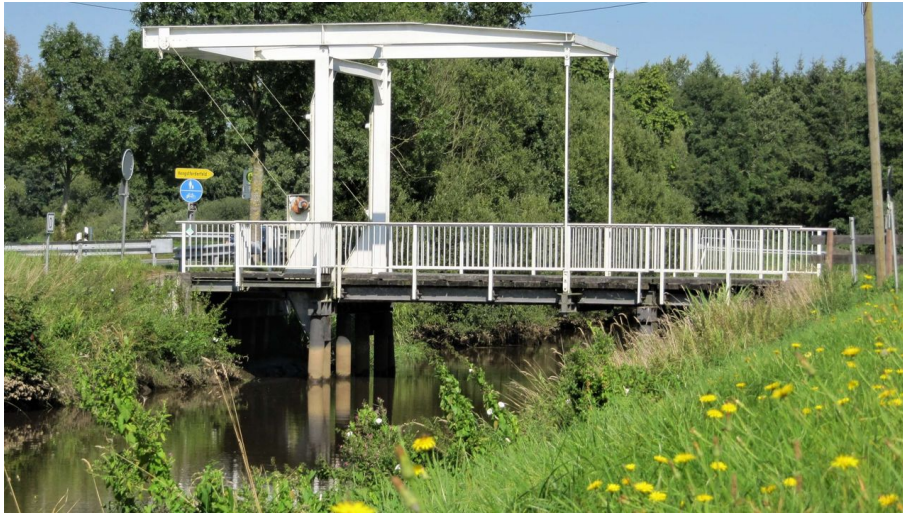
Brücke am Nordloh Kanal