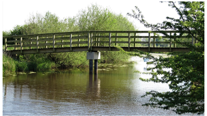
Radler-Brücke in Holtgast