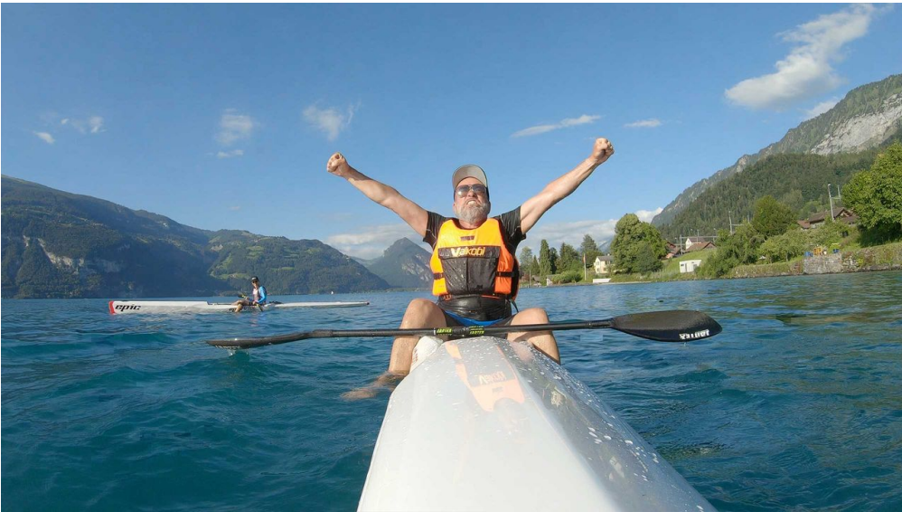
Surfskipoint