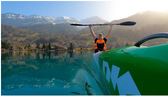
Surfskipoint, Interlaken Tourismus - web@interlaketourism.ch