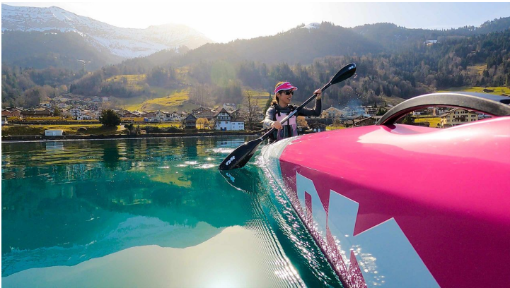
Surfskipoint