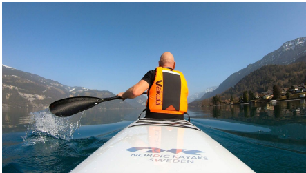
Surfskipoint Gunten