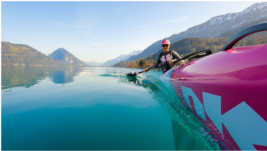
Surfskipoint

cayak / canoe / boat SUP other sports summer