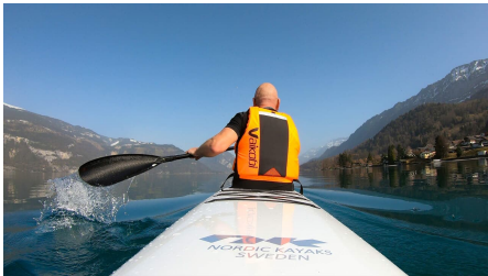
Surfskipoint Gunten