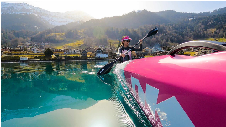
Surfskipoint, Interlaken Tourismus - web@interlaketourism.ch