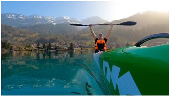
Surfskipoint