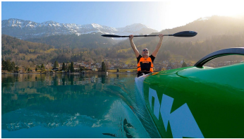
Surfskipoint, Interlaken Tourismus - web@interlaketourism.ch