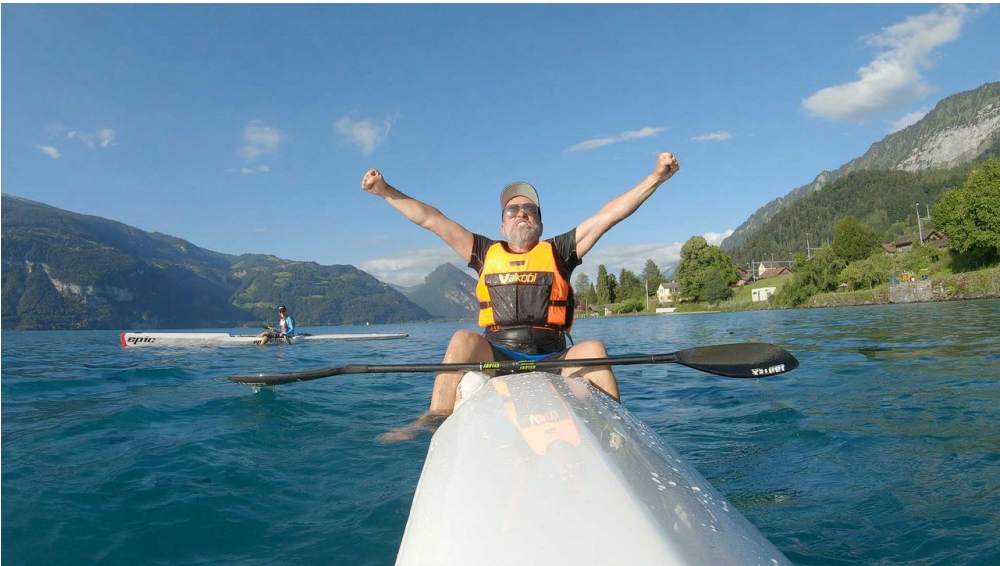
Surfskipoint, Interlaken Tourismus - web@interlaketourism.ch