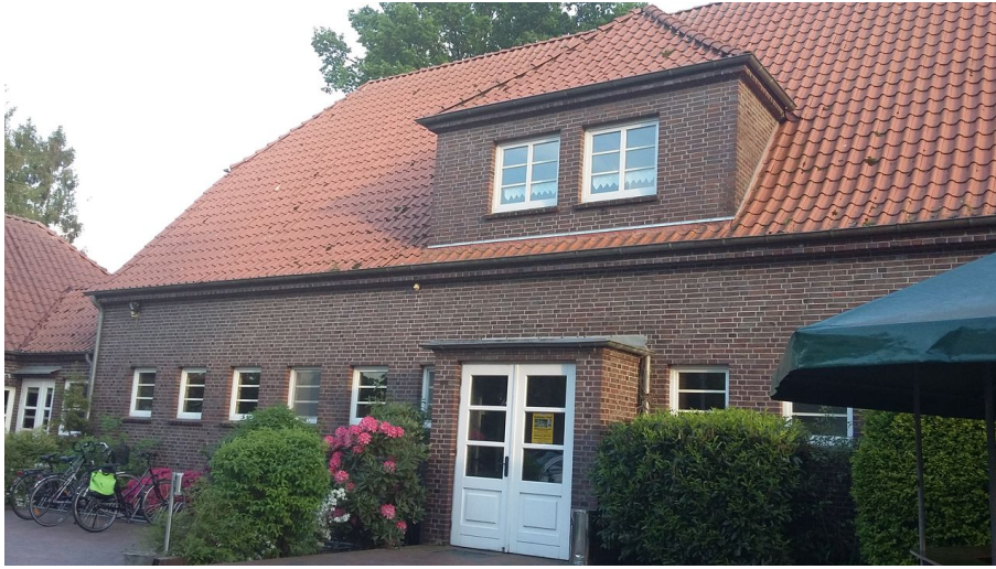
Bokeler Schule (Dörpshus) - © Klaus Dumrath