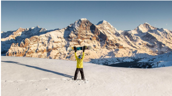
Jungfrau Ski Region – Jungfraubahnen, Interlaken Tourismus - web@interlaketourism.ch