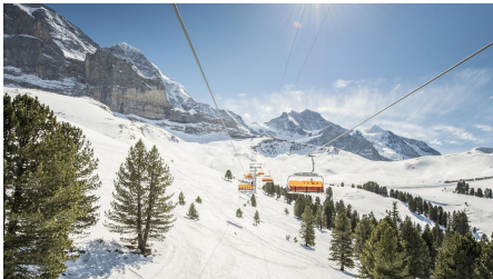
Jungfrau Ski Region – Jungfraubahnen, Interlaken Tourismus - web@interlaketourism.ch