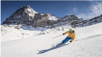
Jungfrau Ski Region