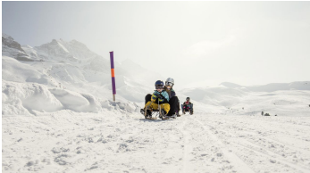
Jungfrau Ski Region – Jungfraubahnen, Interlaken Tourismus - web@interlaketourism.ch