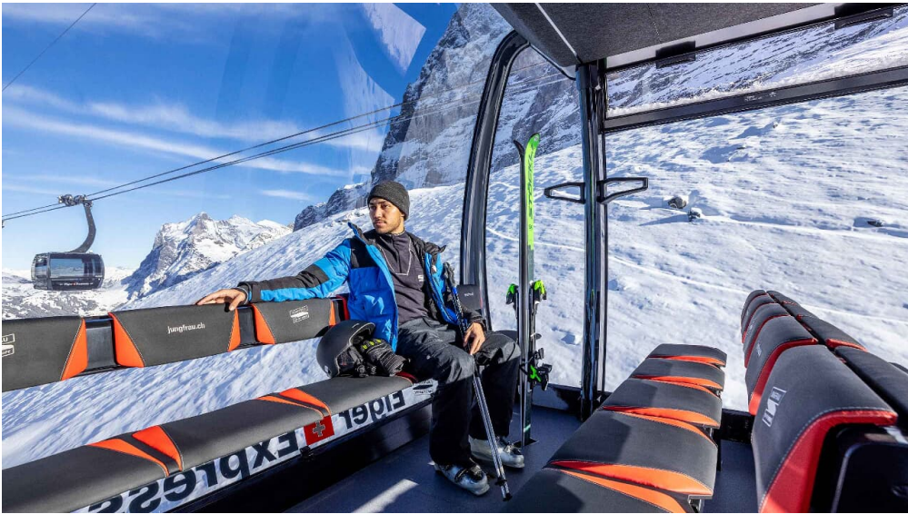
Jungfraubahnen AG, Interlaken Tourismus - web@interlaketourism.ch