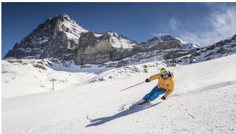
Jungfrau Ski Region – Jungfraubahnen, Interlaken Tourismus - web@interlaketourism.ch