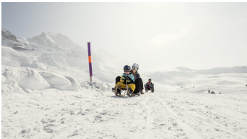
Jungfrau Ski Region – Jungfraubahnen, Interlaken Tourismus - web@interlaketourism.ch