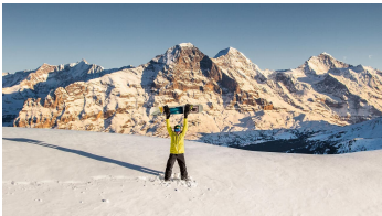
Jungfrau Ski Region – Jungfraubahnen, Interlaken Tourismus - web@interlaketourism.ch