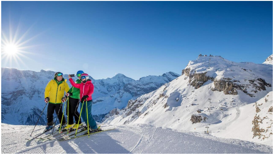
Schilthornbahn, Interlaken Tourismus - web@interlaktourismus.ch