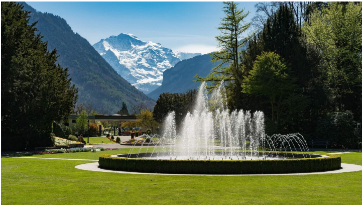
Interlaken Walking Tours, Interlaken Tourismus - web@interlaketourism.ch