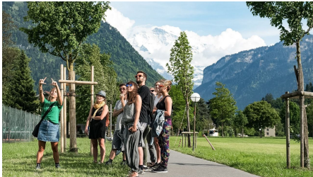
Interlaken Walking Tours, Interlaken Tourismus - web@interlaketourism.ch