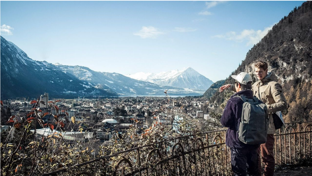
Interlaken Walking Tours, Interlaken Tourismus - web@interlaketourism.ch

Free Walking Tour every Monday, Wednesday & Saturday: 18.00 h Backpackers Villa (Alpenstrasse 16, Interlaken) 18.10 h Höhematte, starting line Jungfrau Marathon (Höheweg 71, Interlaken)