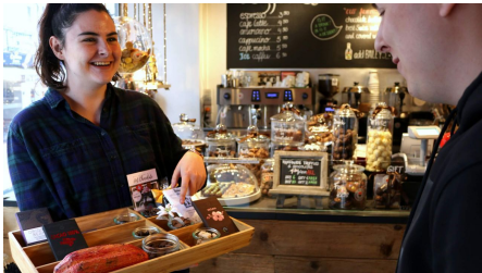
Interlaken Walking Tours, Interlaken Tourismus - web@interlaketourism.ch