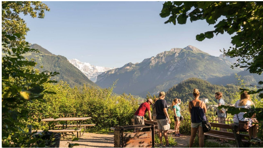
Interlaken Walking Tours, Interlaken Tourismus - web@interlaketourism.ch