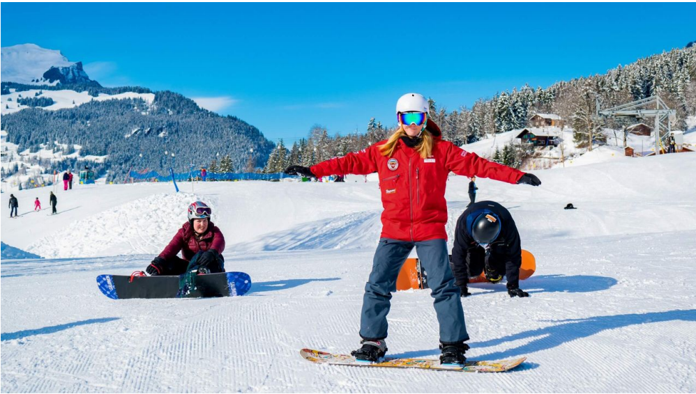
Outdoor Switzerland AG, Interlaken Tourismus - web@interlaketourism.ch