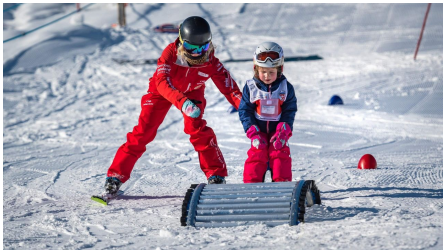
Outdoor Switzerland AG, Interlaken Tourismus - web@interlaketourism.ch