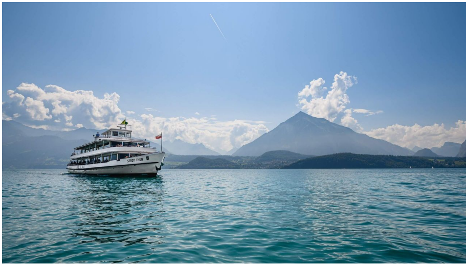
Thun-Thunersee Tourismus, Interlaken Tourismus - web@interlaktourismus.ch