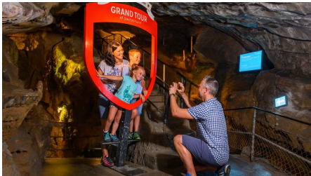
Thun-Thunersee Tourismus, Interlaken Tourismus - web@interlaktourism.ch