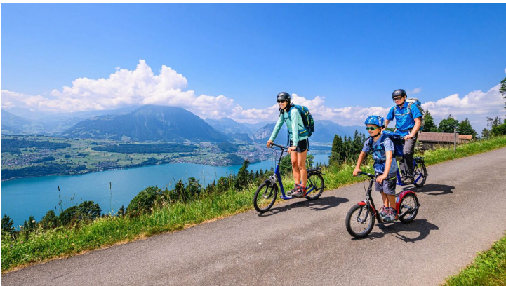
Thun-Thunersee Tourismus, Interlaken Tourismus - web@interlaktourism.ch