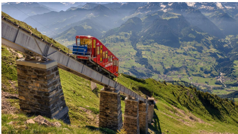
Thun-Thunersee Tourismus, Interlaken Tourismus - web@interlaktourism.ch