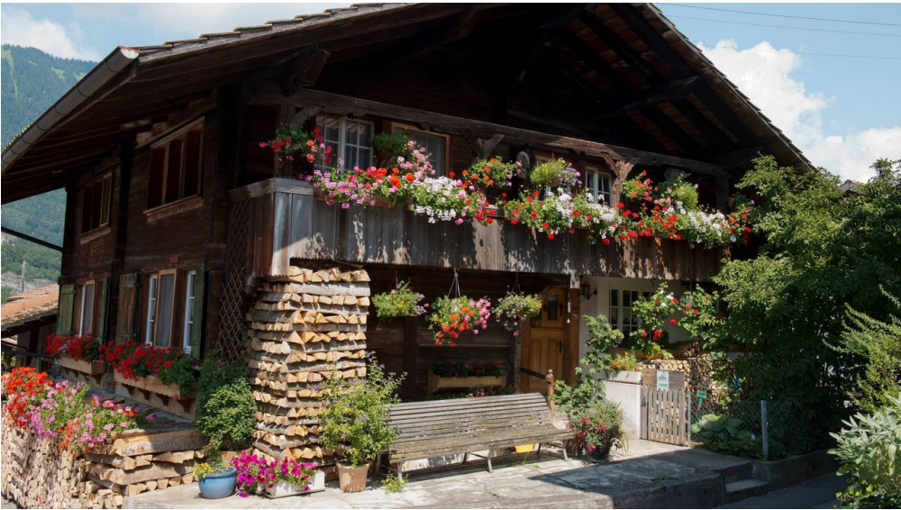
Bönigen-Iseltwald Tourismus, Interlaken Tourismus - web@interlaketourism.ch