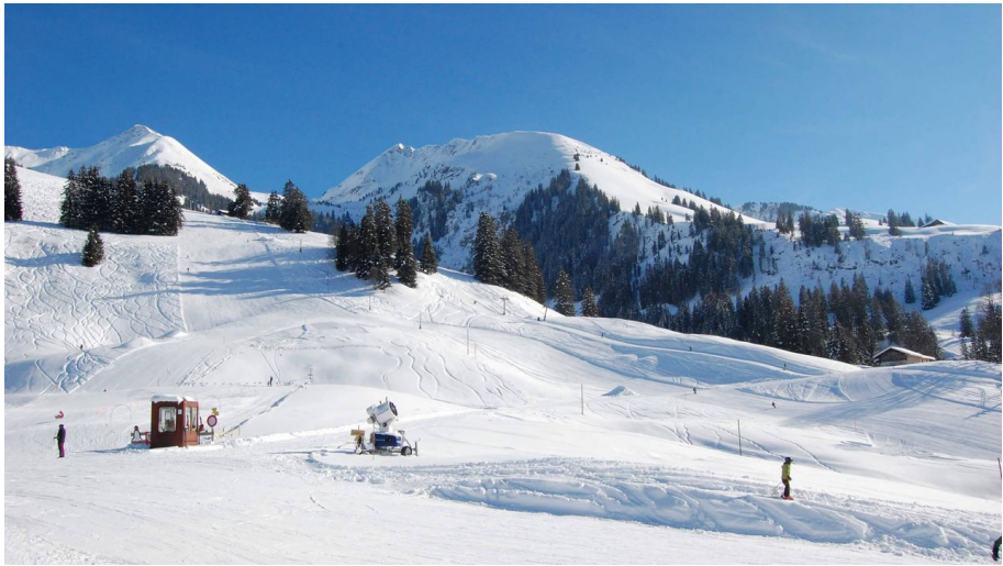
Naturpark Diemtigtal