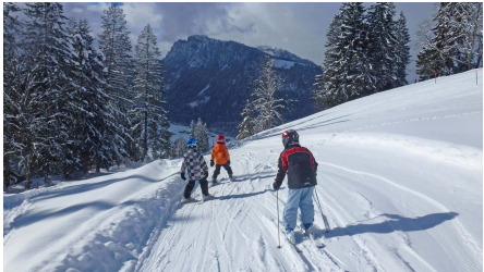
Naturpark Diemtigtal, Interlaken Tourismus - web@interlaketourism.ch