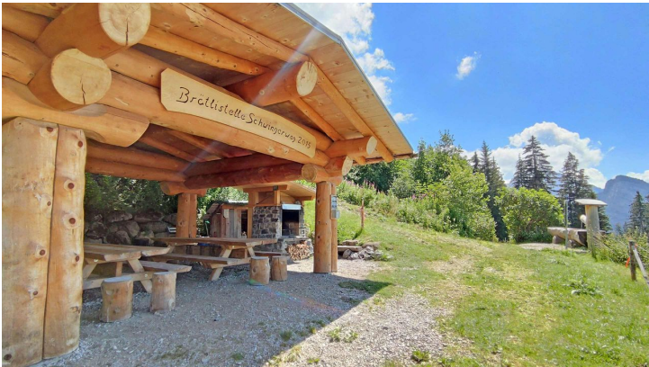
Naturpark Diemtigtal, Interlaken Tourismus