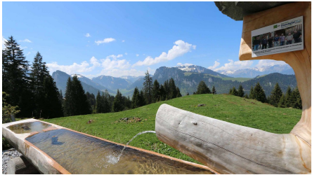
Naturpark Diemtigtal