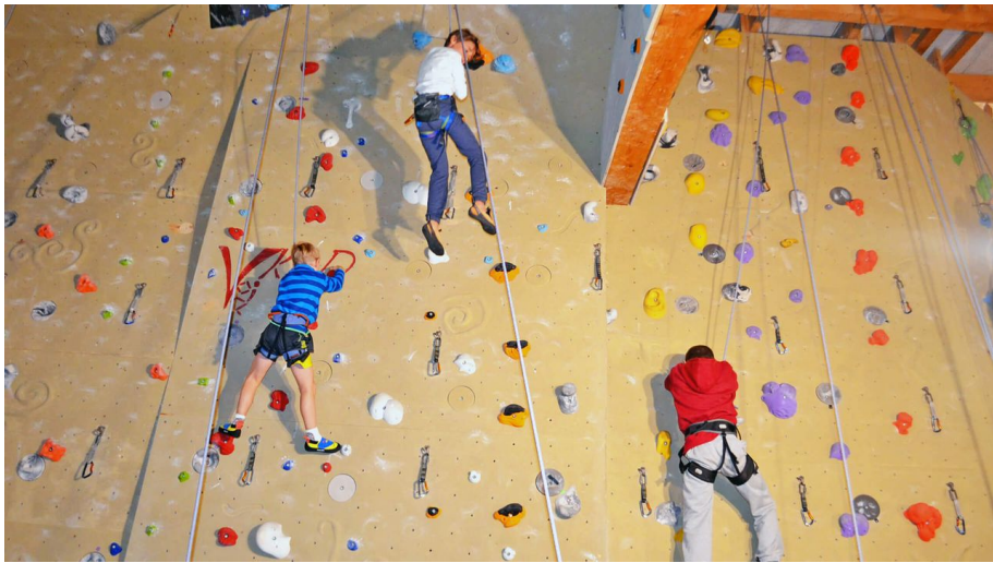
Naturpark Diemtigtal

climbing nature park parking bus company summer winter